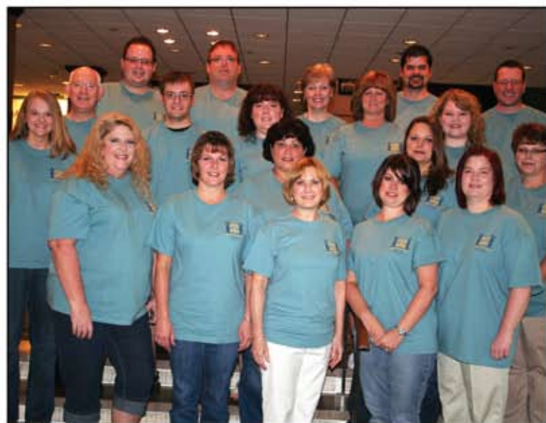
Class of 2011