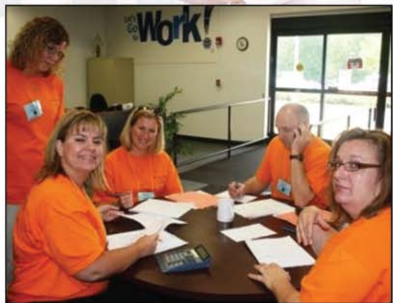
Members of 2009 Class Volunteering for a Community Service Project