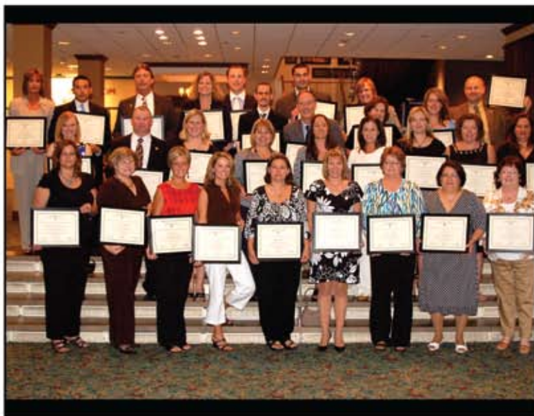
Graduating Class of 2009