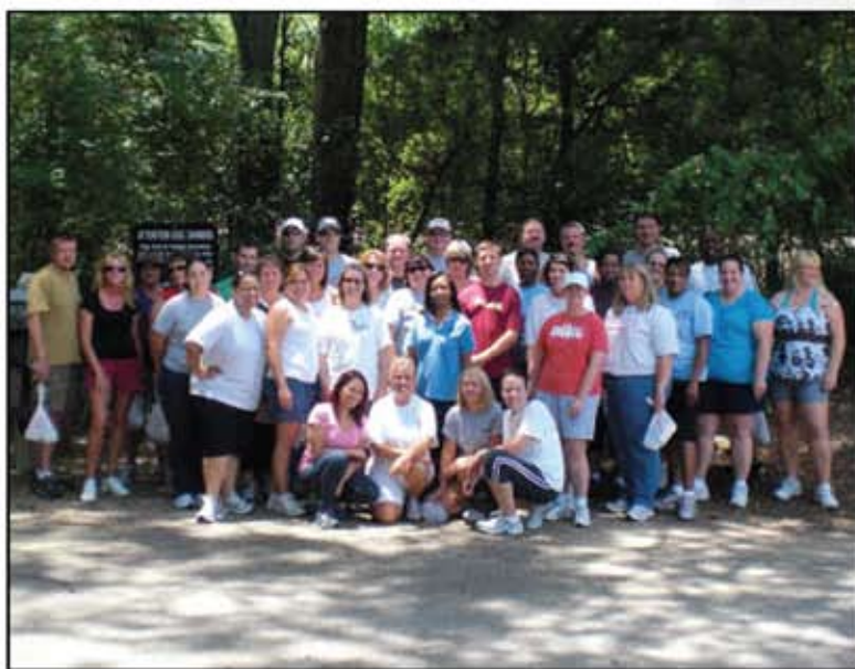
Class of 2010 at the Ropes Course